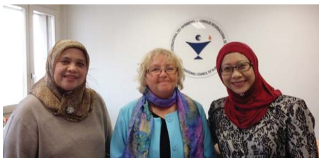
WITH JEAN BARRY, CONSULTANT NURSING & HEALTH POLICY, INTERNATIONAL COUNCIL OF NURSES