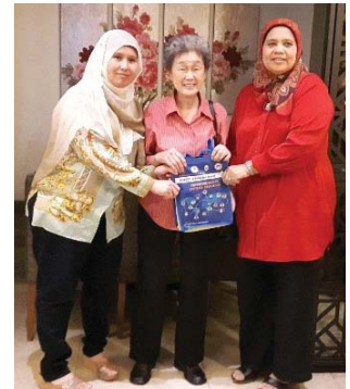
Presentation of Token