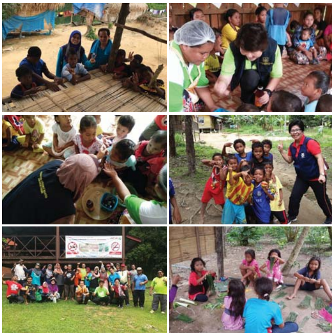
Residence of the original Morfologi Royal Belum State Park

SIG PH Group organized a Working Tour Programme to the Pusat Community Feeding ( RPS ) Kemar Hulu Perak and visited the local Indigenous people( Orang Asli) in the vicinity of the Royal Belum State Park Hulu Perak District on 21/05/2016 -24/5/2016