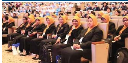
MNA FRONT LINE