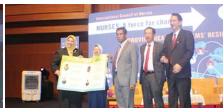
PRESENTATION OF CARD FOR MALAYSIAN NURSES FROM MINISTRY OF HEALTH