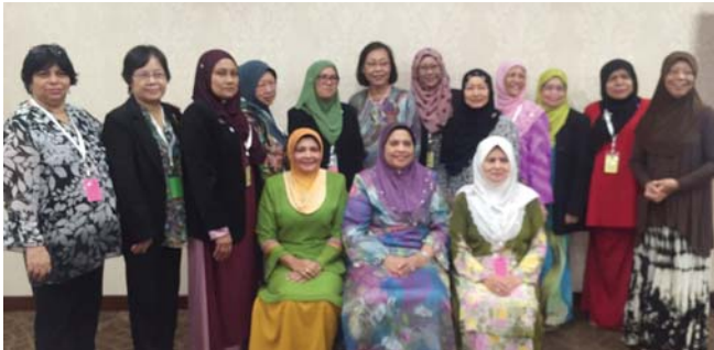
MNA SECRETARIAT WITH GNLI EXCO MEMBERS

MNA Head Quarters has taken the initiative to organise the programme for those who have attended the GNLI to share their experiences and knowledge to benefit the other Nursing leaders.