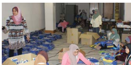
COMMITTEE BUSY PREPARING FOR THE IND