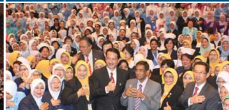
DISTIGUIST GUESTS WITH THE NURSES