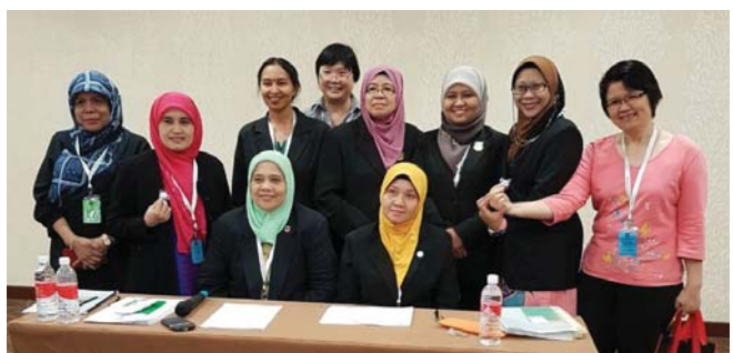
PRESIDENT WITH NEW BRANCH CHAIRMAN