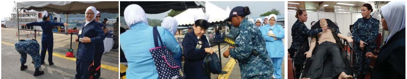
Body search and bag check before you can board. We were giggling with fun. Security was very tight and they even checked our identity card. All names were submitted a week before for approval.

We are friends. We are in a ship. Put them together and we form "Friendship"