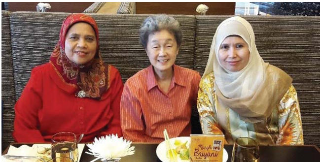
MNA President, Past & Present SIG Perioperative Chairman