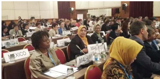
REPRESENTATIVES OF ICN'S NATIONAL NURSING ASSOCIATION (NNA)