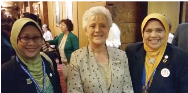
OPENING ADDRESS BY: HRH PRINCESS MUNA AL HUSSEIN