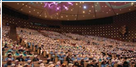
THE UNITY OF MALAYSIAN NURSES