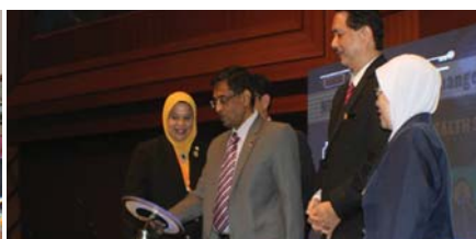
LAUNCHING OF IND 2016 BY YB MINISTER OF HEALTH